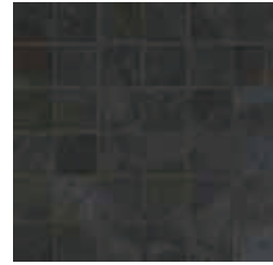
B-54 Malla PIETRA Mustang 31,6 x 31,6 cm.