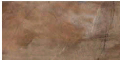
B-30 PIETRA Oxid 31,6 x 63,5 cm.