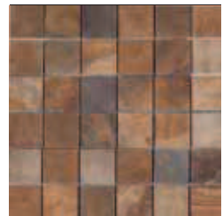
B-54 Malla PIETRA Oxid 31,6 x 31,6 cm.