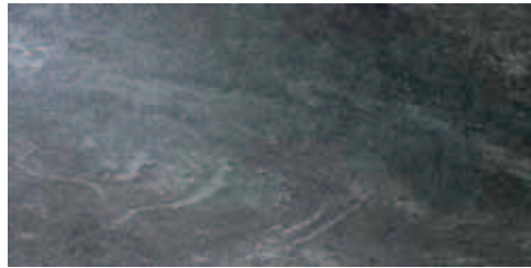
B-30 PIETRA Antracita 31,6 x 63,5 cm.